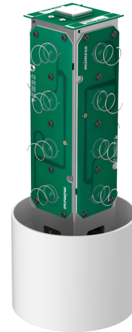
Quad Sector 360° Antenna

* 4.9 GHz uses 20 MHz channel widths (US only, regulations vary by region) ** Enabled in future software release